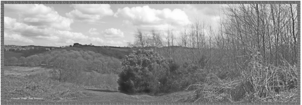
Clouds over Downs Bank

Finally Rod Whiteman spoke of the success of using cattle to graze part of Downs Banks to restore what had been a bracken-covered area to true heathland, with the resulting return of appropriate flora and fauna. Our