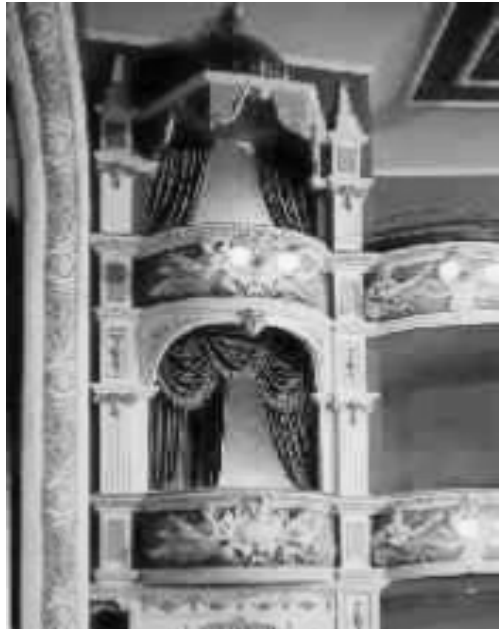
Detail from Lyceum Theatre

Woodhey Chapel is a Grade 1 listed private chapel; the listing describes the chapel as ‘a handsome and intact example of a chapel from a period when few were built’. The chapel, now disused except for three services each year, stands in fields near the site of the demolished Woodhey Hall. In a Will dated 1537 there is a possible reference to a domestic chapel at Woodhey. The present chapel was built around 1690 by Lady Wilbraham. It stands in beautiful Cheshire countryside and was restored in 1926.