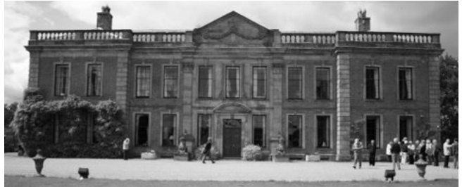
Members arriving at Oakley Hall

Blue skies and warm sunshine greeted the 60 members who visited Tissington Hall. The Hall was built in 1609 replacing a moated manor house but the FitzHerbert family had arrived in England with