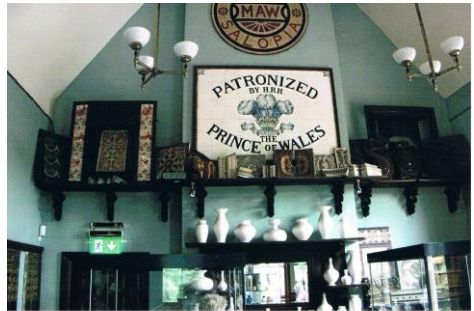
Display "Maw & Co"