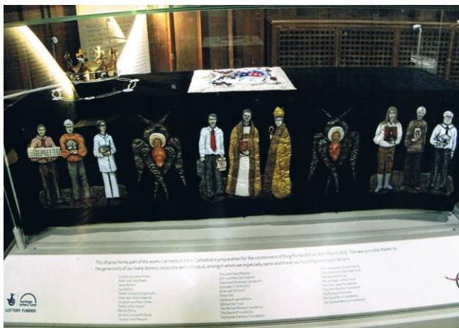
Display listing donors and embroidered images of involved personnel