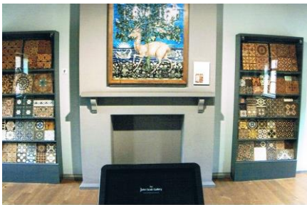
John Scott Gallery