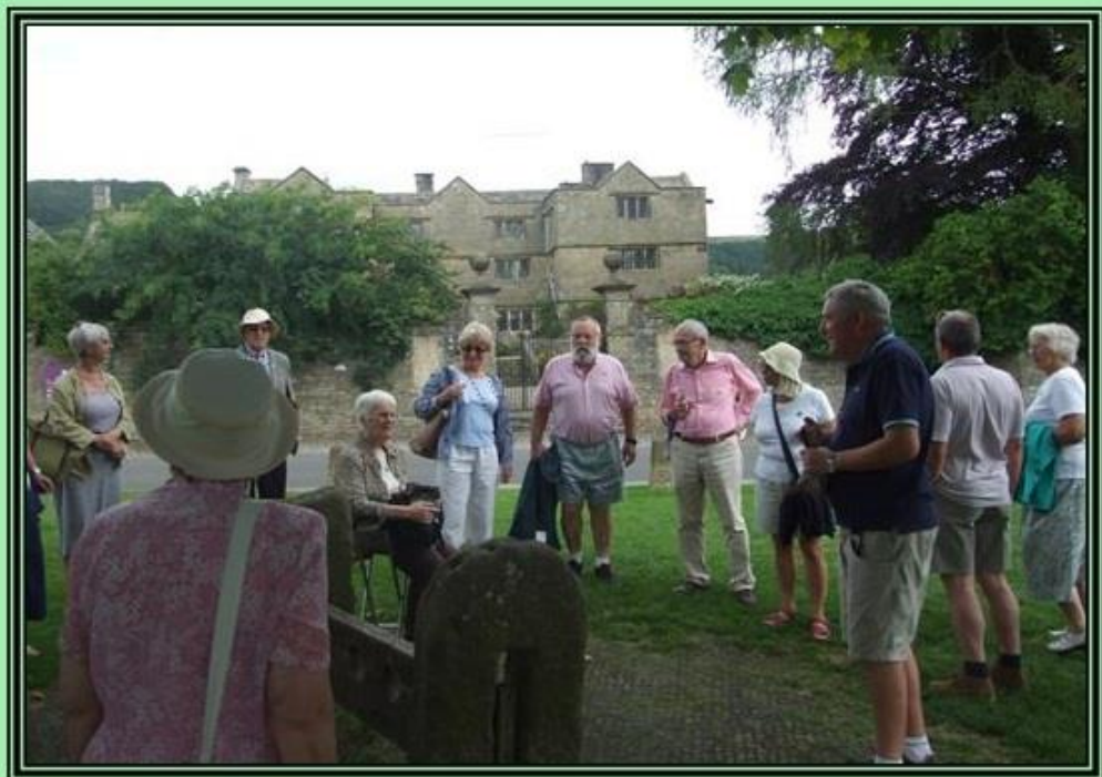
Taking stock by Eyam Hall