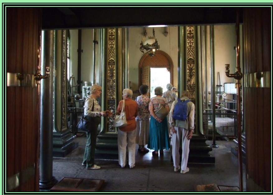
Admiring the Victorian workmanship at Papplewick