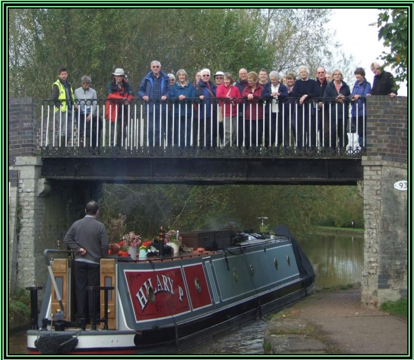
On our Nantwich walk