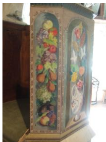
2nd September 2011

Having no more events to report on, we continue with our theme of reviewing some photos of past events. We thank Cynthia Dumbelton for these images from the "Arts and Crafts and the Seaside" holiday in September 2011. (These photos, and more, are also on the web site to a larger scale, along with photographs from the reports above.)