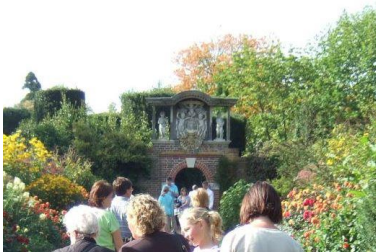
3rd September 2011

Some of the magnificent dahlias on display