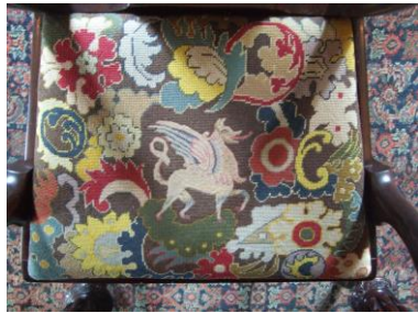
4th September 2011