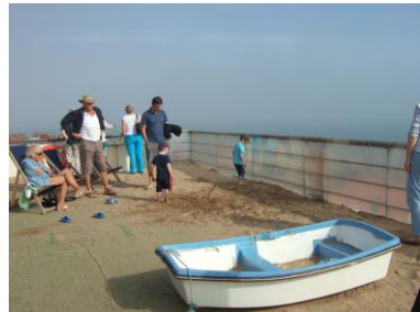
2nd September 2011