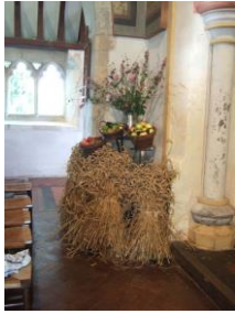
2nd September 2011