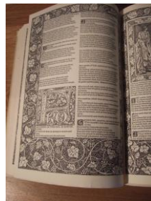
5th September 2011