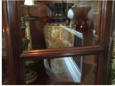
4th September 2011