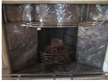
4th September 2011