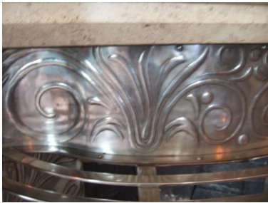
4th September 2011