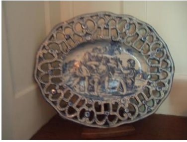
4th September 2011