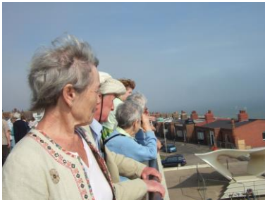
2nd September 2011