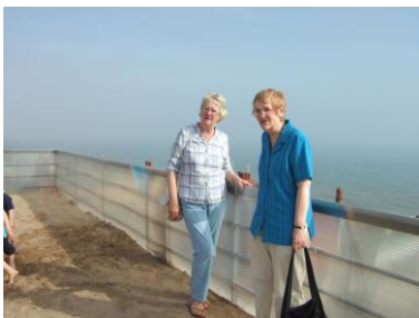
2nd September 2011