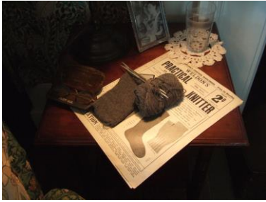
4th September 2011