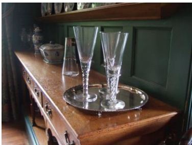
4th September 2011