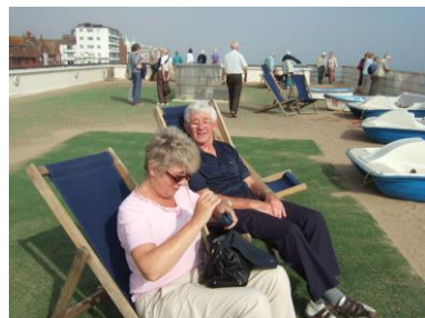
2nd September 2011