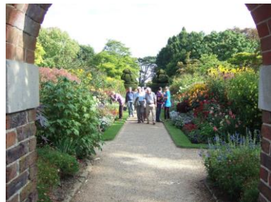
3rd September 2011