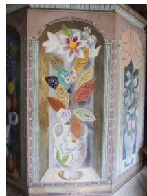
2nd September 2011