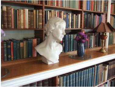
4th September 2011