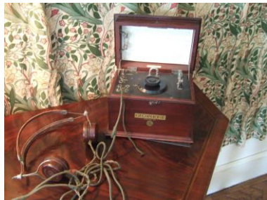
4th September 2011