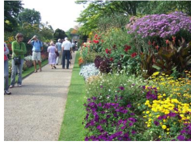
3rd September 2011