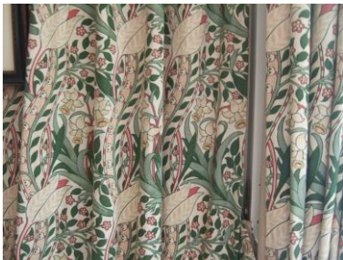
4th September 2011