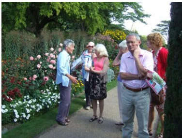
3rd September 2011