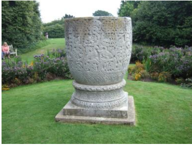
3rd September 2011