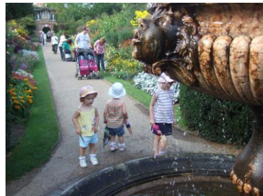
3rd September 2011