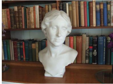
4th September 2011