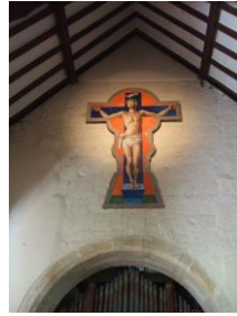
2nd September 2011