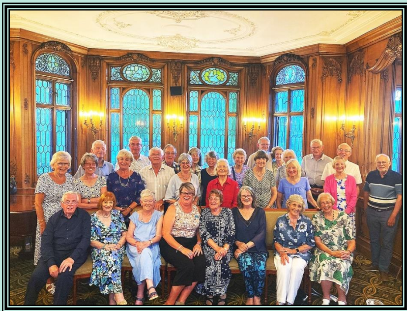
Northumberland holiday group in the Olympic themed Swan Hotel, Alnwick