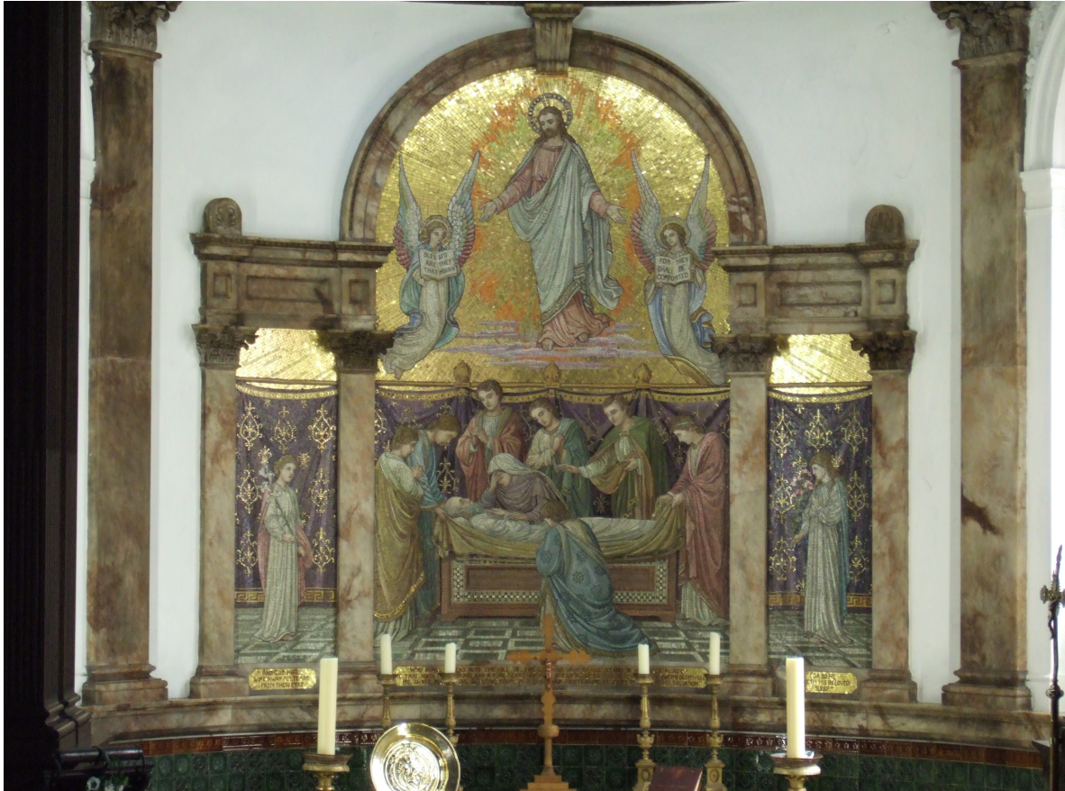
Inside the chapel at Capesthorne Hall

for the new hall. On this occasion, the remains of a Roman road were discovered and the presence of a Bronze Age tumulus in the grounds indicated activity in the area before the arrival of the Capesthorne family, the first of only three families to have owned the estate. Val's knowledge of these three families, the Capesthorne, the Wards and the Davenports, was extensive and she kept us informed and entertained about the more notable or eccentric members throughout the tour.